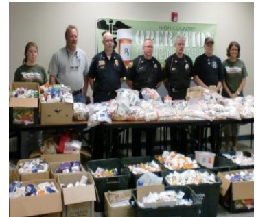
Drug Take-Back Event

To dispose of prescription and over-the-counter drugs, call your city or county government's household trash and recycling service and ask if a drug take-back program is available in your community. Some counties hold household hazardous waste collection days, where prescription and over-the-counter drugs are accepted at a central location for proper disposal.